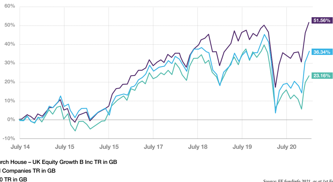
Source: FE fundinfo 2021, as at 1st February 2021